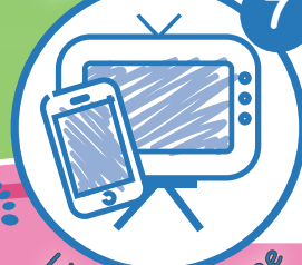
Limit screen time