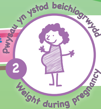
Weight during pregnancy

If you are planning to start a family, aim to be a healthy weight.