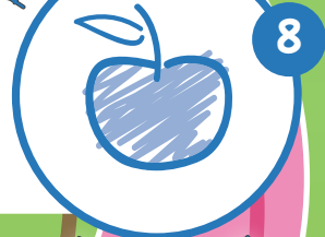
Fruit and veg

Rhowch ffrwythau a llysiau i'ch plant bob dydd.